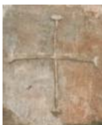
Processional Cross Dunfermline Abbey

‡ The name of abbot I derived from the Syriac, and signifies a “father” (Mark xiv.36; Rom. Viii.15); the abbot being the father, or head of the monks. In the first institution of abbots, it is said, they were secular persons, and had no rank in the church, notwithstanding tht they made outwardly a profession to pray to God in their cells. The name of abbot is sometimes taken for a person of quality, as a lord, the best abbacies being at one time possessed by lords, who were obliged to serve in time of wars. These abbots were commonly dukes or earls, and were called earl-abbots, arch-abbot, or military-abbots, while those who were churchmen, as a distinction from the others, were named reverend or most reverend abbots.