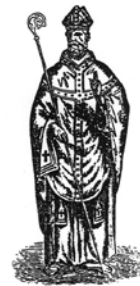
Mitered Abbot of the Order of St. Benedict.

Note: - See the above as a separate extract listed on Web page.