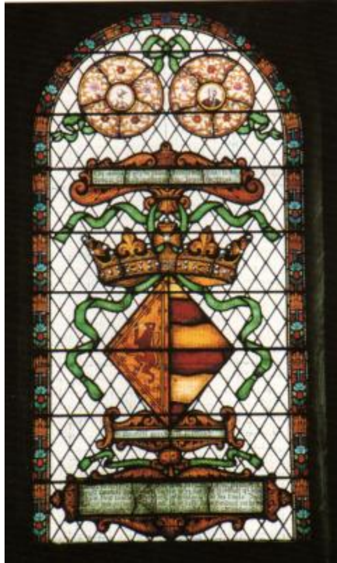
Armorial window of Annabella Drummond Queen of Robert III of Scotland .

New version, Livingston, 6th August 2009.